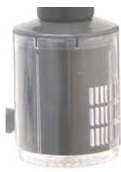
Bubble Reducing Trap