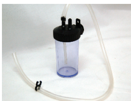
Air Inlet Silencer