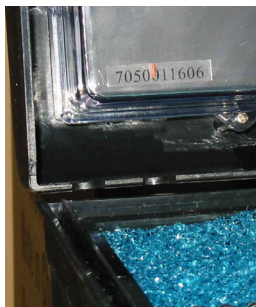
SERIAL NUMBER/DATE CODE ON REFLECTOR

Note: if your 12-Gallon Aquapod has a serial number on the reflector or on the box, it is NOT being recalled.